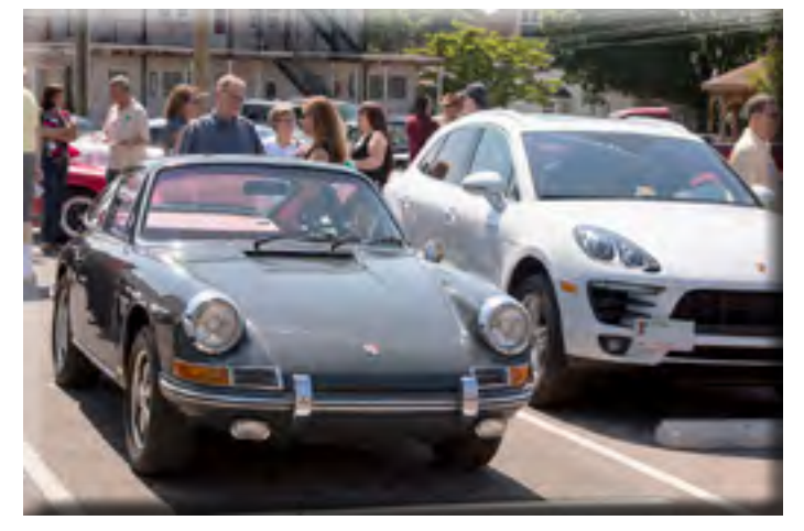
Members and Porsches at Blue Apron in Salem, VA.