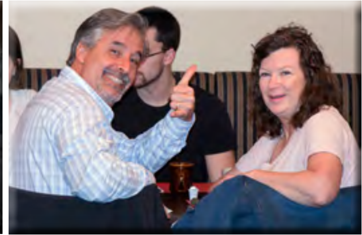
Cafe in Moneta, VA.