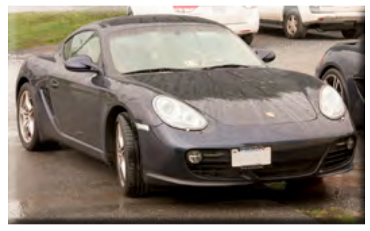
Most of us drive when it is raining, proving Porsches do not melt when wet. It takes more than a little rain to dampen our fun.

Often the scenery is great, like this view at Martinsville Airport. A Porsche drive, scenery, food, and friends is a good combination