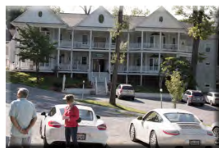
Some of our group and cars at Oak Hill in Lynchburg, Virginia.

Not only are these brunches excellent social an opportunity, but a chance to learn more good places dine. Many locations to offer other things to do after eating. So drive your Porsche and join us. Casual is the word and good friends are there with you. Dates & places are on our website and Facebook page, and in Monday Morning Porsche Piddlings.