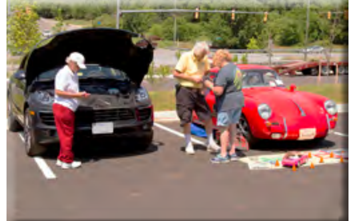
Occasionally we stop at a cruise-in. You never know who you are going to see there.