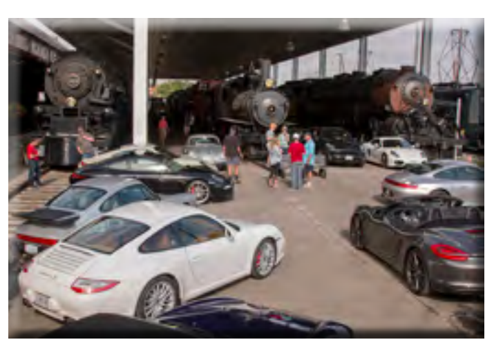
Porsches and trains at the Roanoke Museum of Transportation.