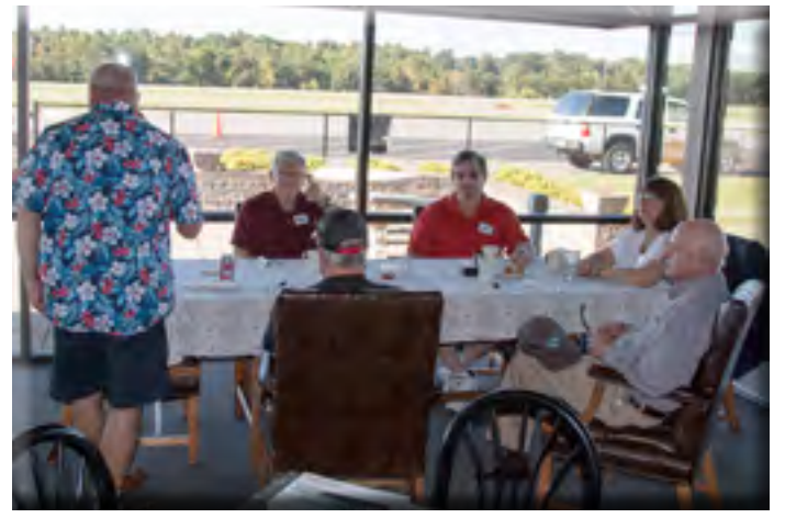
Our view of the airport at Simply Suzanne's in Martinsville, VA.